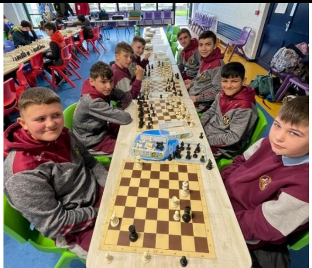
Bring it on.... The Courtenay Kings are ready!