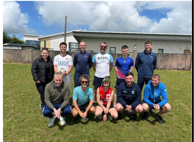
Bring on 6 th ....we're ready...we've got this!!