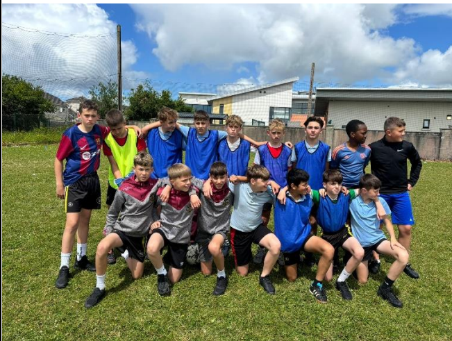
6 th class ready for battle!!

Well done to the staff on their third consecutive win! Great sportsmanship was shown by all participants.